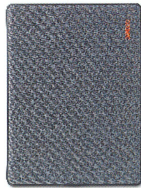
Bamboo Slate, small Bamboo Slate, large